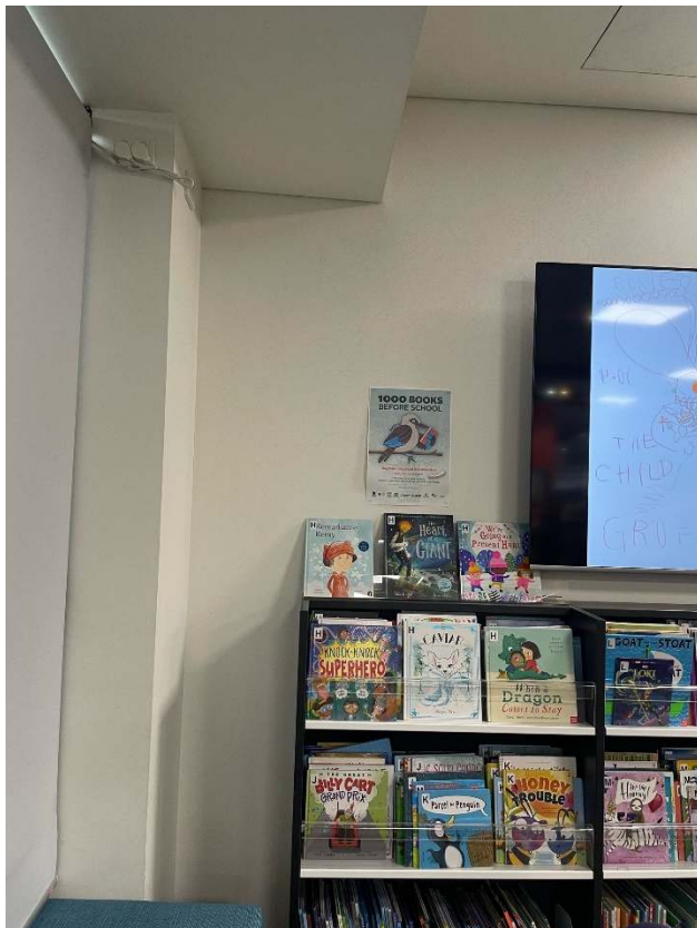
Figure 3 and 4: Children's area at Clive James Library and Service Centre, Kogarah, August 2024.