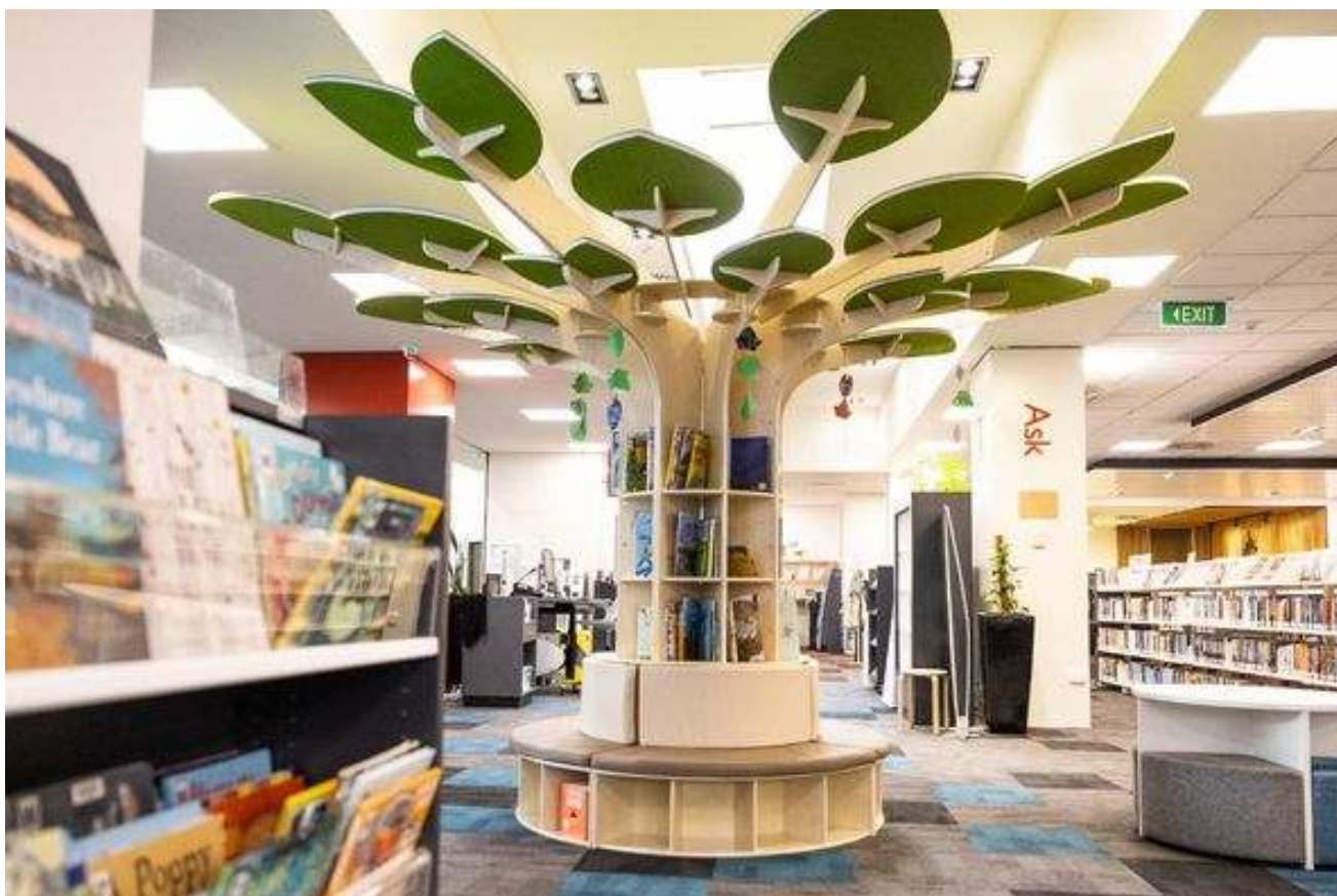
Figure 1: Reading tree at Clive James Library and Service Centre, Kogarah, July 2024.