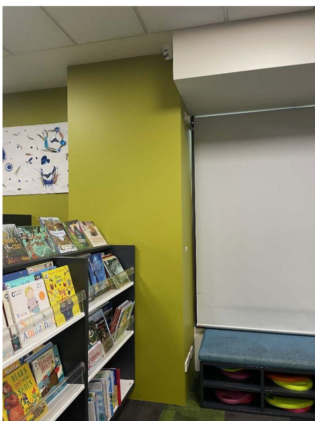
Figure 5 and 6: Children's area at Clive James Library and Service Centre, Kogarah, August 2024.