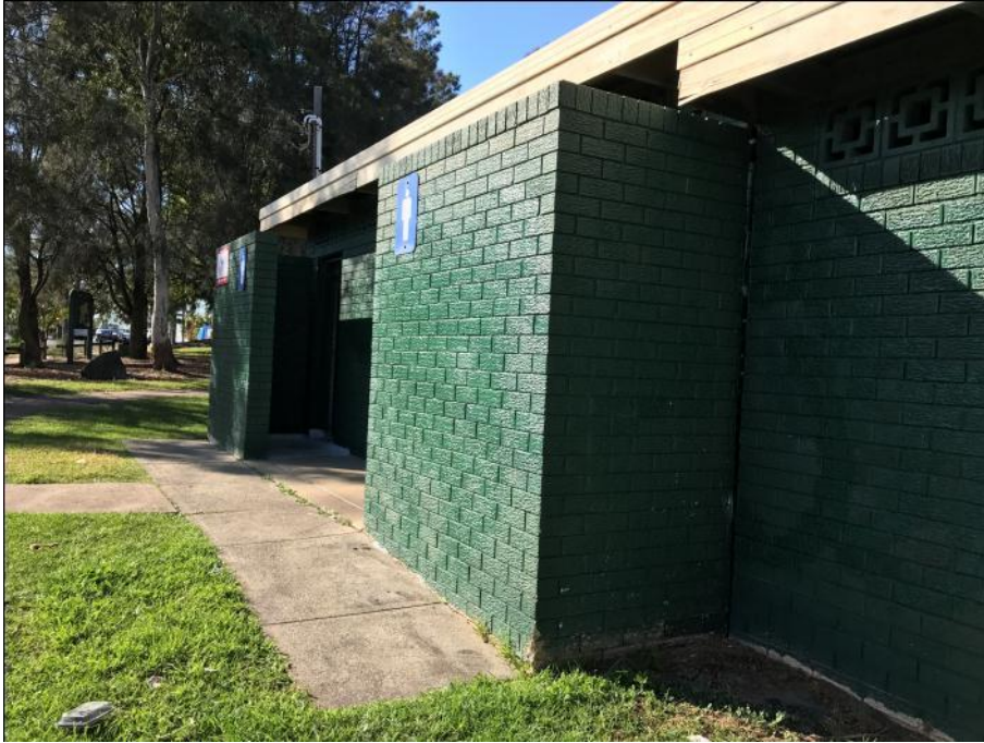
Figure 12: Amenities building located on the Durham Street frontage (Photograph, June 2017)