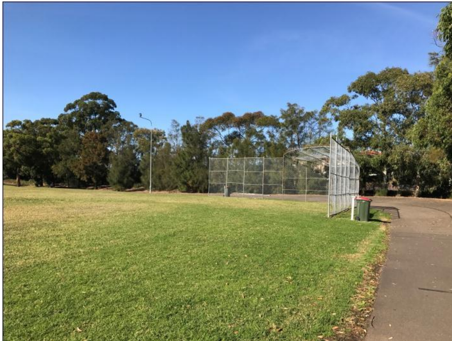
Figure 10: Baseball nets located in the south western corner (Photograph, June 2017)

A range of groups and individuals currently use Kempt Field including one-off sporting group bookings (eg AFL and baseball), community groups, school groups (local public and private schools) and informal usage (Tai Chi, exercise groups, bocce, cycle and running track).