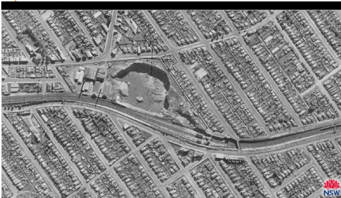
Kempt Field Aerial 1943

Disclaimer: This report has been generated by various sources and is provided for information purposes only. Spatial Services does not warrant or represent that the information is free from errors or omission, or that it is exhaustive. Spatial Services gives no warranty in relation to the information, especially material supplied by third parties. Spatial Services accepts no liability for loss, damage, or costs that you may incur relating to any use or reliance upon the information in this report.