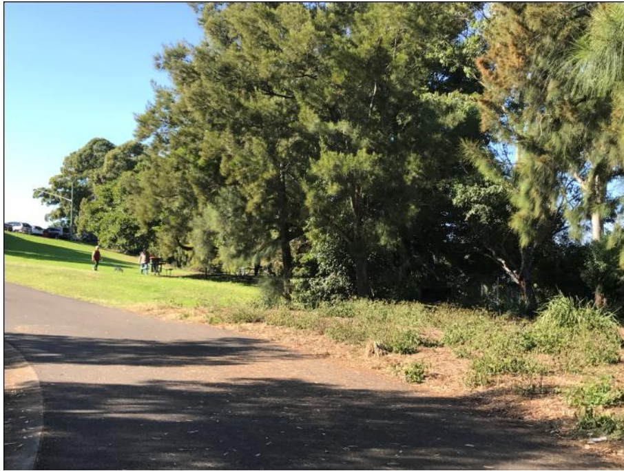
Figure 7: View of the southern boundary of the site (adjacent to the Illawarra Rail Line) showing boundary landscaping.