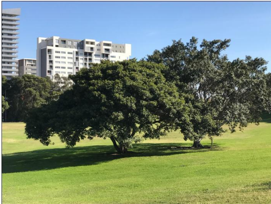
Figure 6: Existing landscaping in the centre of the site showing grassed areas and feature trees planting (Photograph, June 2017)