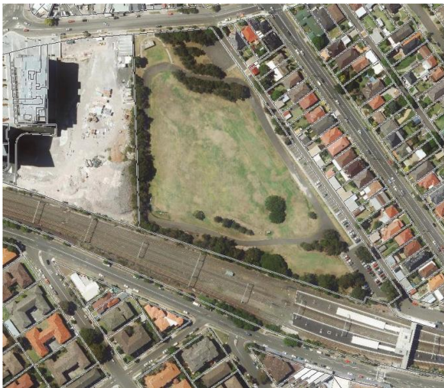
Figure 1: Kempt Field and Surrounds

The Kempt Field Plan of Management applies to a 3.173 hectare site on the eastern edge of the Hurstville City Centre, fronting Durham Street and bounded by Roberts Lane to the east, the Illawarra Rail Line to the south and the "East Quarter" development to the west. The site comprises Lot 1 in Deposited Plan 596535 which is known as 75 Durham Street, Hurstville as shown in Figure 1 below.