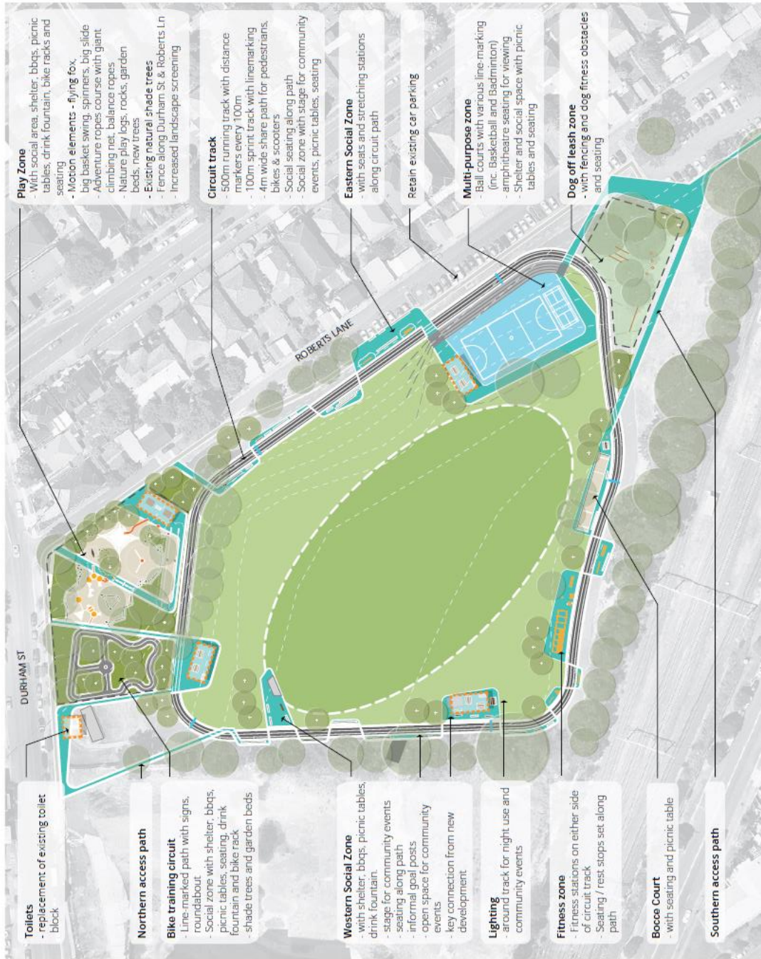
Figure 15: Kempt Field Masterplan Extract