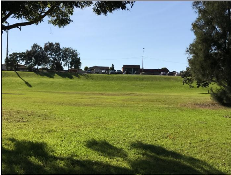
Figure 9: View looking east showing land sloping up to Roberts Lane, car parking and the rear of residential properties fronting Lily Street (Photograph, June 2017)