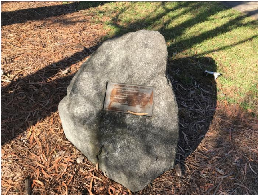
Figure 13: Scout Hall memorial stone located on the Durham Street frontage (Photograph, June 2017)