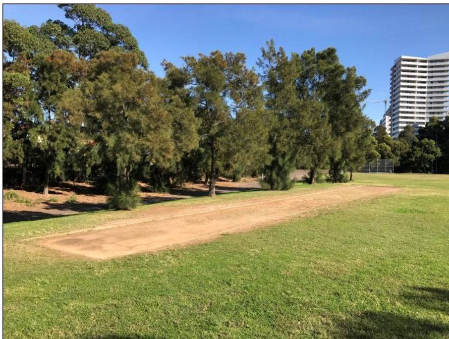
Figure 11: Bocce court located towards the southern boundary (Photograph, June 2017)