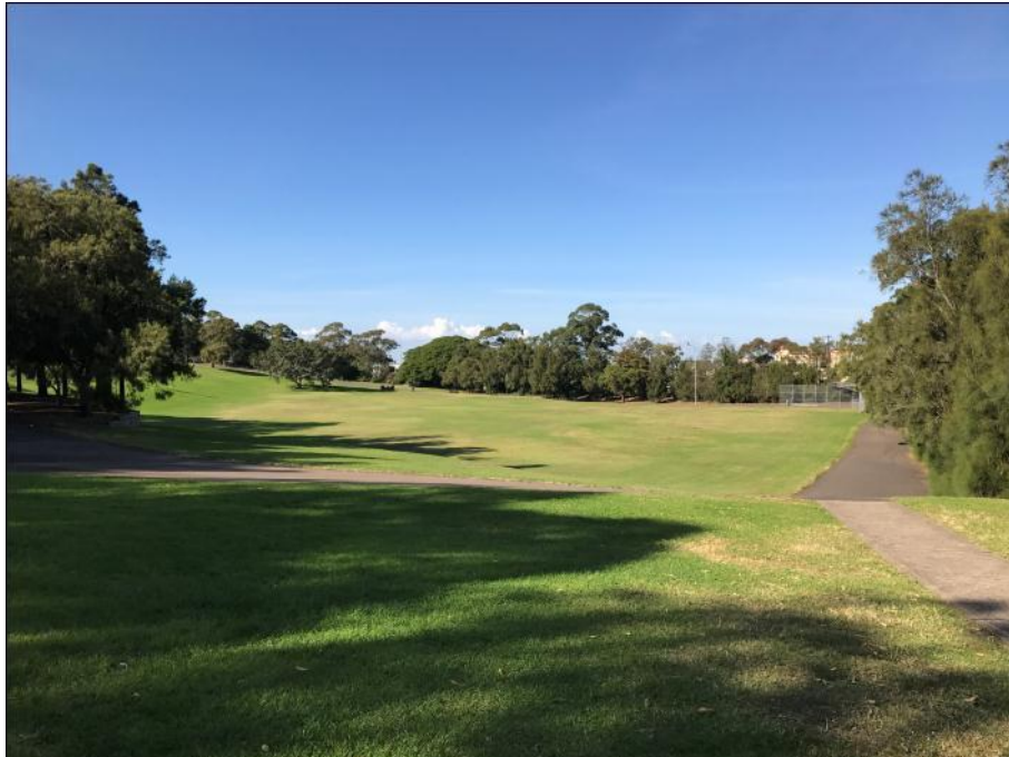
Figure 8: View looking south across Kempt Field showing landscaping along the southern boundary and interrupted views of residential development along Railway Parade (Photograph, June 2017)