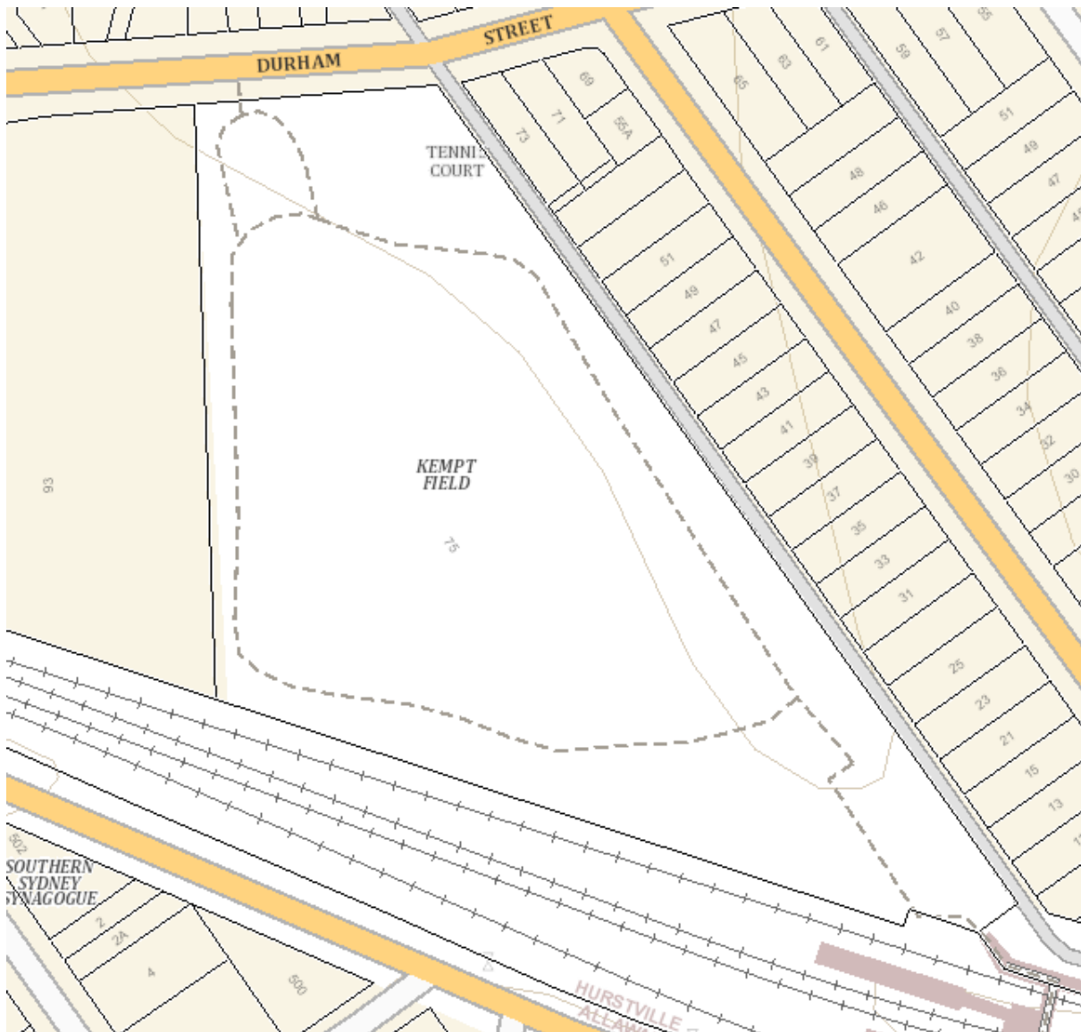
Figure 2: Kempt Field and Surrounds