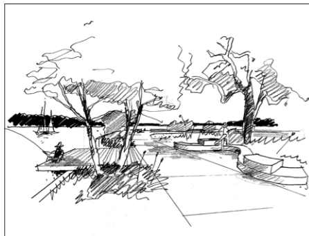
VIEW B – Kogarah Bay edge, east